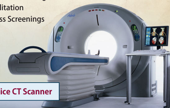
Knapp's 64-slice CT Scanner